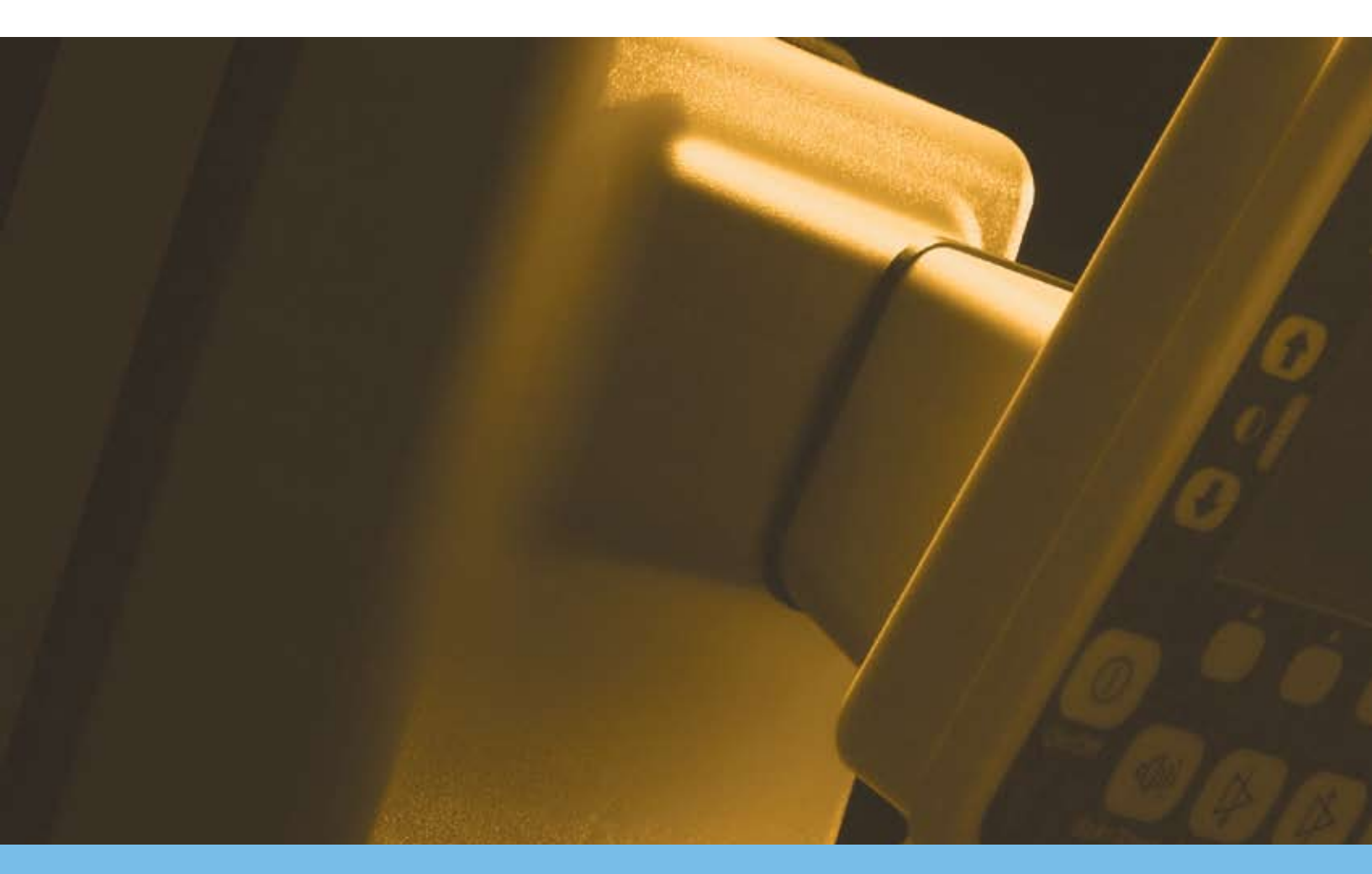
GPS Interface Allows Real-Time Mapping

Cable/Pipe and Fault Locator 2273M Cable/Pipe, Fault and Marker Locator 2273M-iD